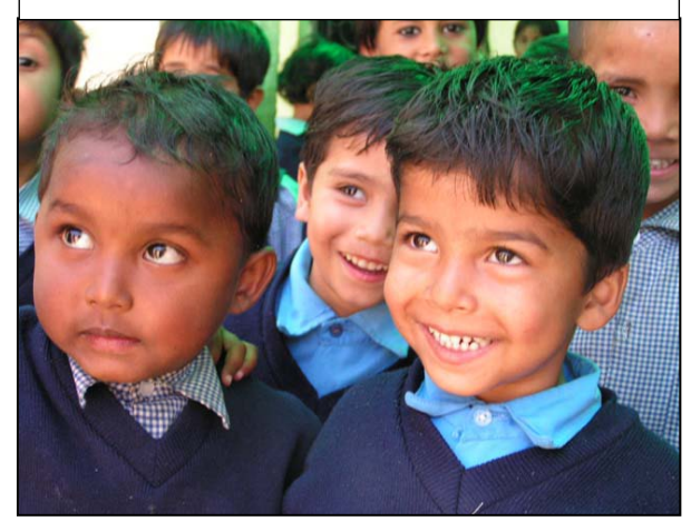
This smile has to be alive